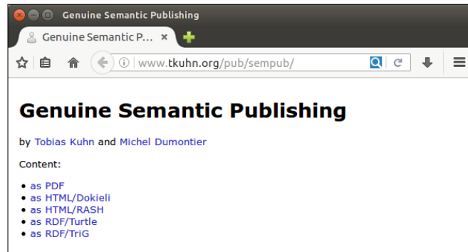
Figure 2. The landing page pointing to different versions of the work.

And then we can link to different representations of the content of the given work: